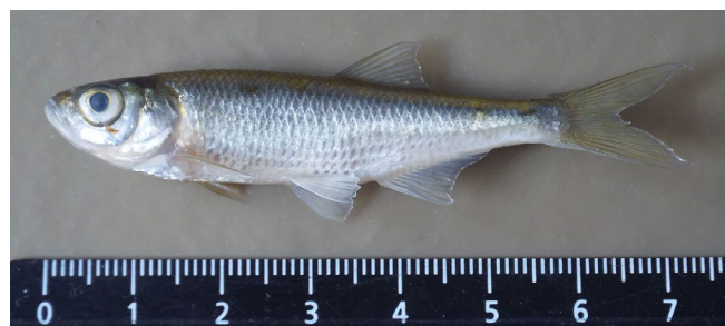
Fig.1. Sunbleak Leucaspius delineatus (Heckel, 1843).

propagation. Sunbleak penetrated into Pre-Baikal water bodies in 1973 together with fish breeding material of carp Cyprinus carpio Linnaeus, 1758, brought into a Kudareya pond (the basins of the Kuda and Angara Rivers) from the fish farm “Zerkal'ny” in Novosibirsk Region (Demin, 1997; Demin and Abramensk, 1998). It is now known that sunbleak inhabits the mainstream of the Angara and Irkut Rivers, as well as in the downstream of the Kaya and Olkha Rivers (Matveev and Samusenok, 2009; Ponkratov, 2014; Yuriev et al., 2021).