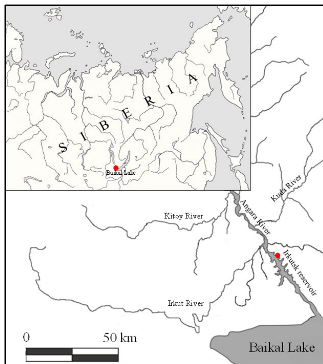
Fig.2. Sampling site, the Irkutsk Reservoir (the Angara River).

Determination of the species specific fragment of the Cox1 gene allowed identification of a single haplotype found in all specimens. Comparative analysis and phylogenetic reconstruction based on the nucleotide sequences accessible in the genetic databases showed that the studied species is represented by three phylogenetic lineages (Fig. 3). The nucleotide differences of the fragments of the Cox1 gene in sunbleak in the comparative data analysis from the GenBank database were 5.5%, and within the phylogenetic lineages the nucleotide sequences differed by < 3%.