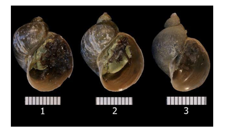
Fig.1. Spire height variations of shells of R. auricularia inhabiting the littoral zone near the Zarechnoye settlement.

Snails with the shortest spire height were minor in the samples collected in 2019 and were excluded from further analyses. According to the results of the nonparametric analysis (Mann-Whitney test), the shell of the snails with high spire significantly (p < 0.05) differed from snails with low spire. The main characters that subdivided these two groups were also shell height, shell height/spire height and aperture height/ spire height. However, in the plane of two principal components, the snail groups were represented by significantly overlapping clouds (Fig. 2).