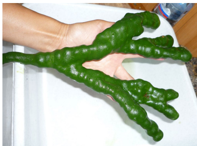
Fig. 1. Endemic Baikal sponge Lubomirskia baicalensis (Pallas, 1773)

Total protein was extracted from three replicates of each sample frozen in liquid nitrogen immediately after the temperature treatment. Protein from the L. baicalensis sponge was extracted as described previously (Voinikov et al., 1986). Protein concentration in the samples was determined with Quant-iT™ Protein Assay Kit (Thermo Fisher Scientific). 30 µg of protein from each sample were separated by electrophoresis in 12% SDS-PAGE (Laemmli, 1970) then the protein was transferred onto a nitrocellulose membrane in a